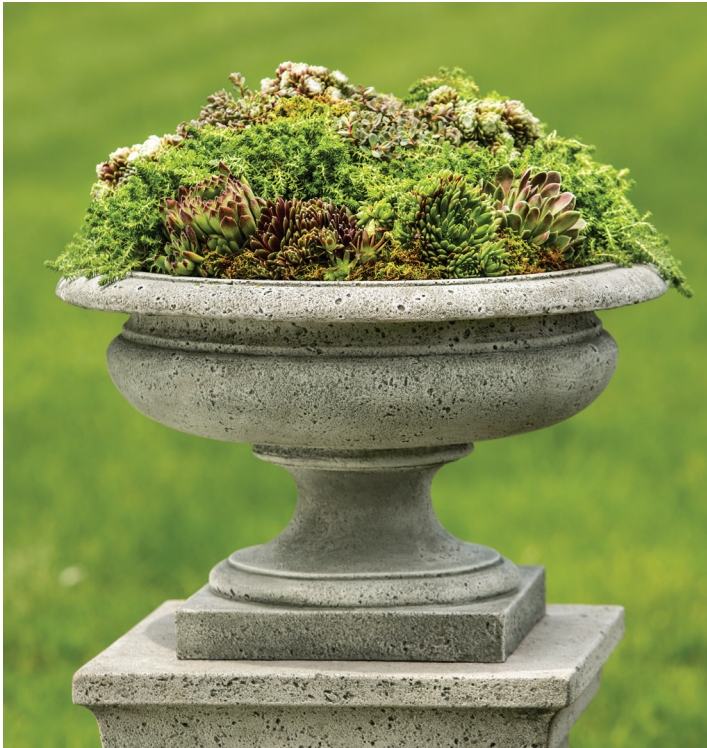
Shown in Alpine Stone