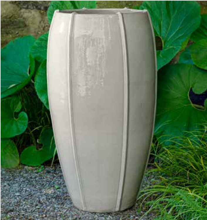
Shown in Cream