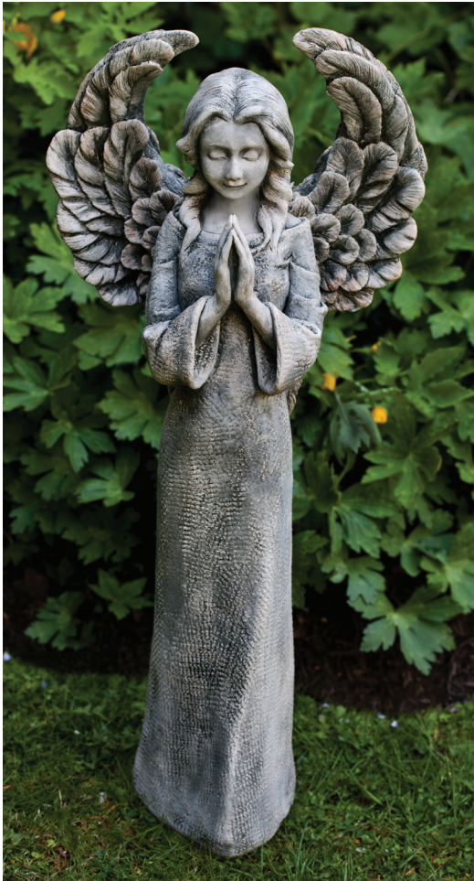
Shown in Alpine Stone