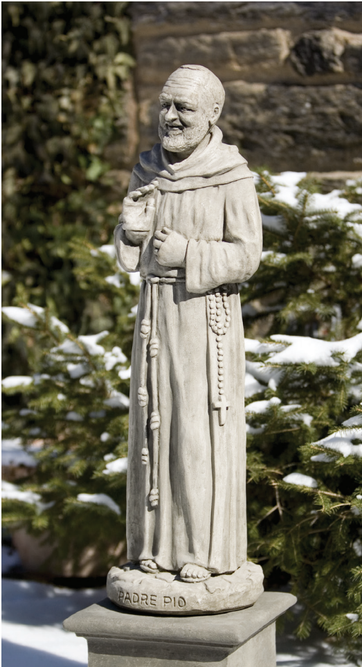
Shown in Greystone