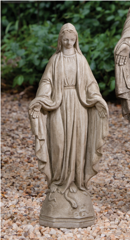
Shown in Verde