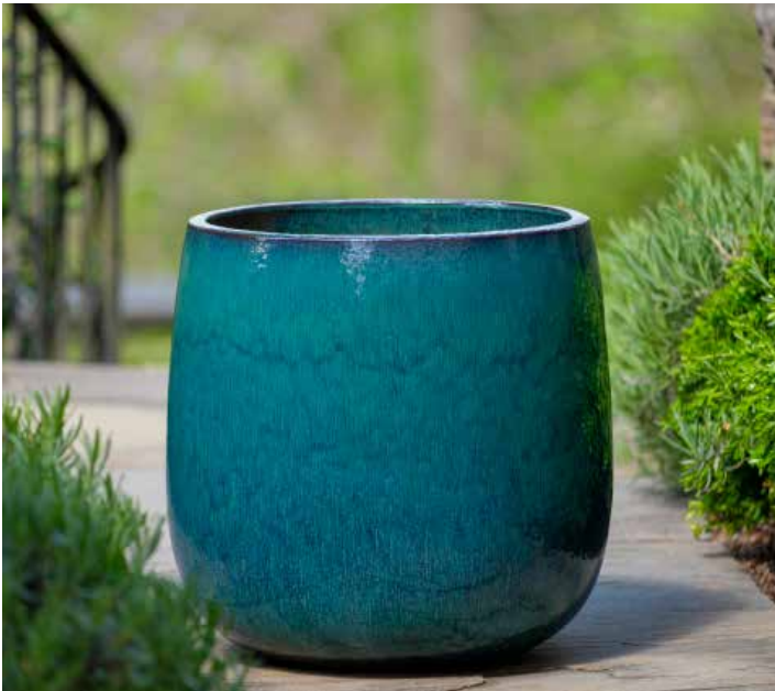
Shown in Indigo Rain