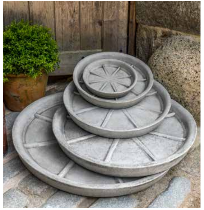
Shown in Alpine Stone