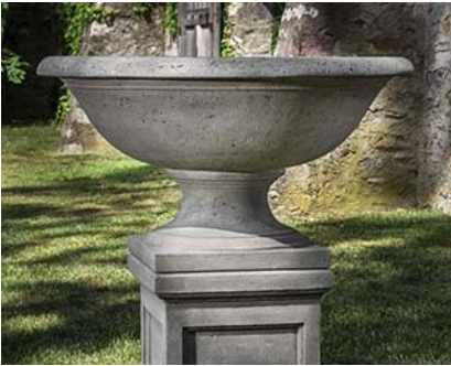
Shown in: Alpine Stone (AS)