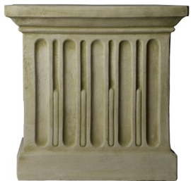
English Moss (EM)