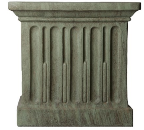
Copper Bronze (CB)