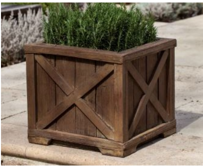
Shown in: Pietra Vecchia (PV)