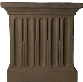
Pietra Vecchia (PV)*