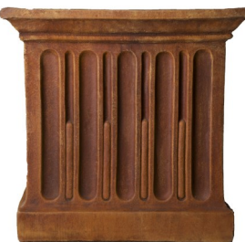
Ferro Rustico (FR)*