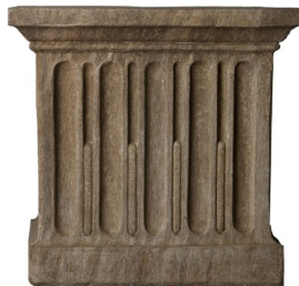
Aged Limestone (AL)