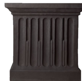
Terra Nera (TN)*