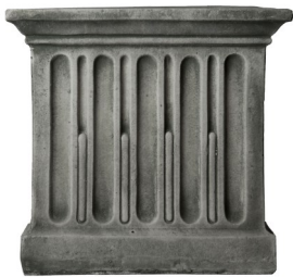
Alpine Stone (AS)

Due to the hand-application process and photography, actual colors may vary slightly from those depicted in these examples. Please consult our catalog photos and our website for examples of variations of our patinas.