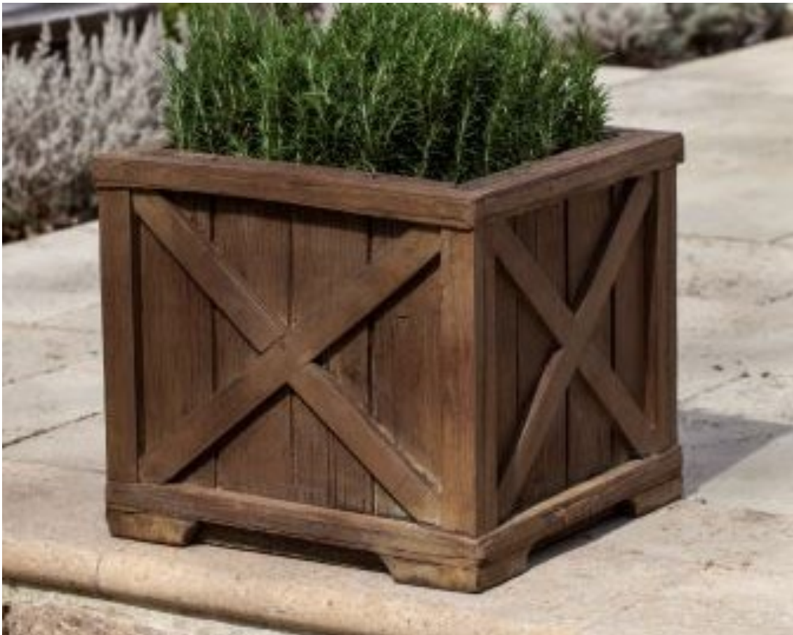
RUSTIC VERSAILLE PLANTER