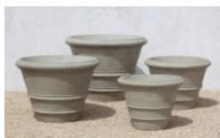
Shown in: Verde (VE)