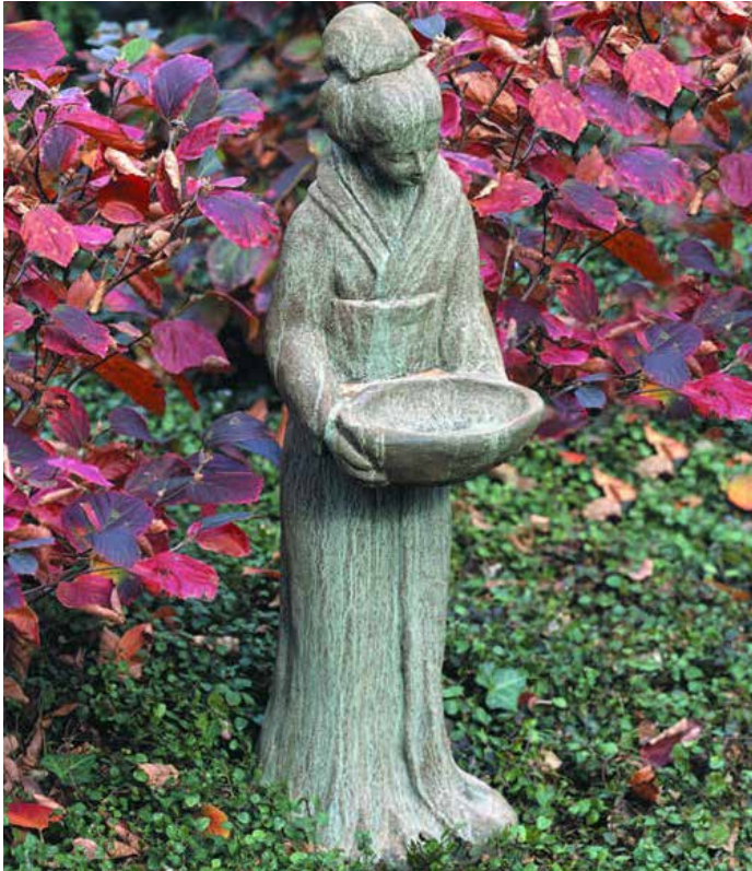
Shown in Copper Bronze