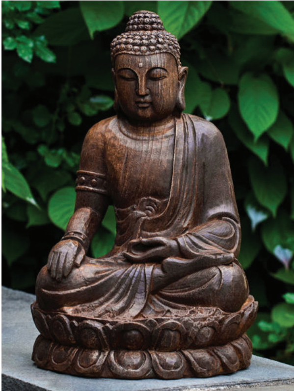
Shown in Pietra Nuova