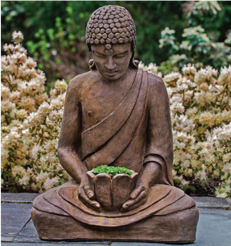
Shown in Pietra Nuova