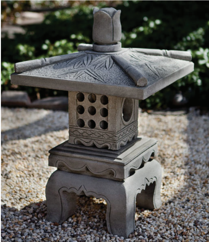
Shown in Greystone