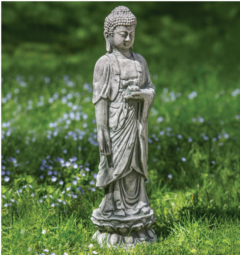
Shown in Alpine Stone