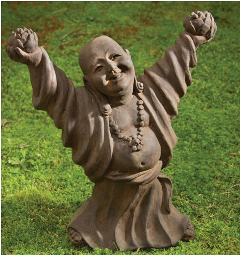
Shown in Pietra Nuova