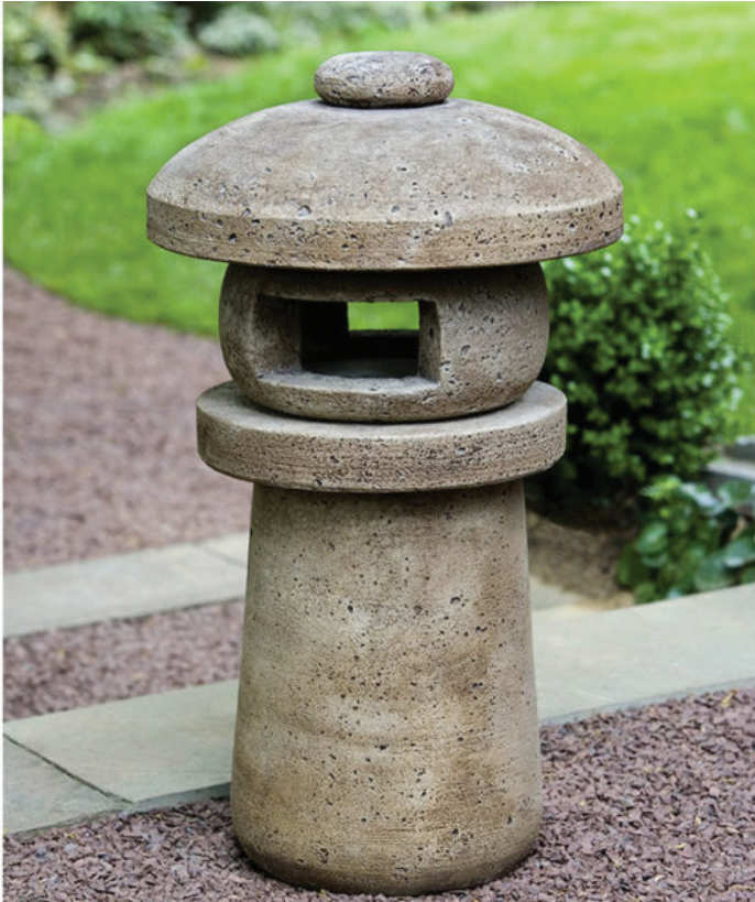
Shown in Brownstone