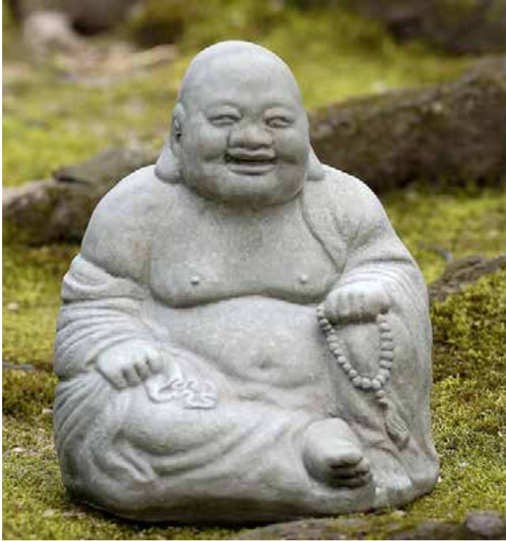
Shown in AB