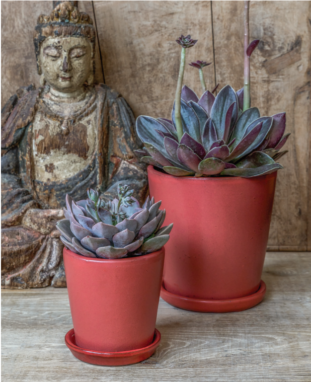
Shown in Coral