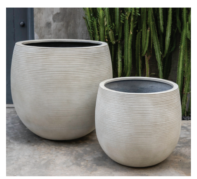
Shown in Ivory