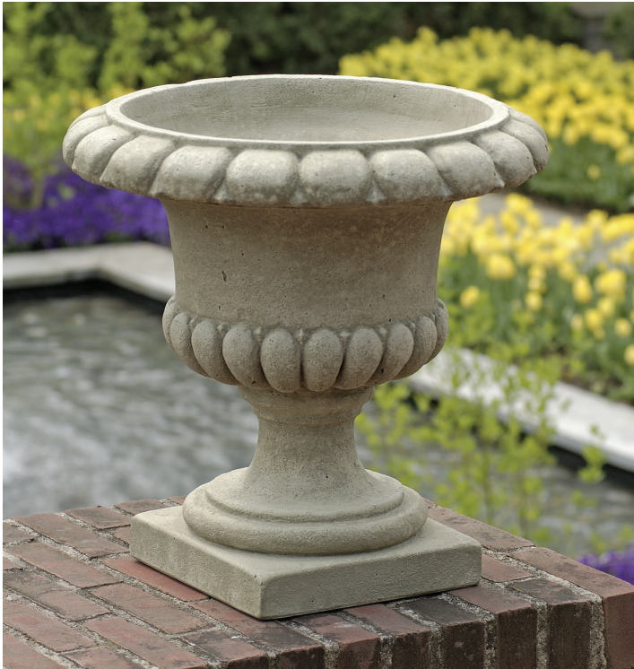
Shown in Verde