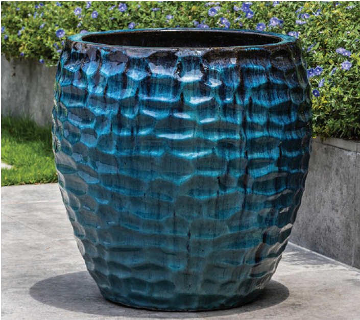
Shown in Mediterranean Blue