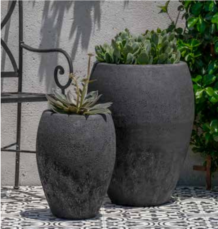
Shown in Volcanic Coral