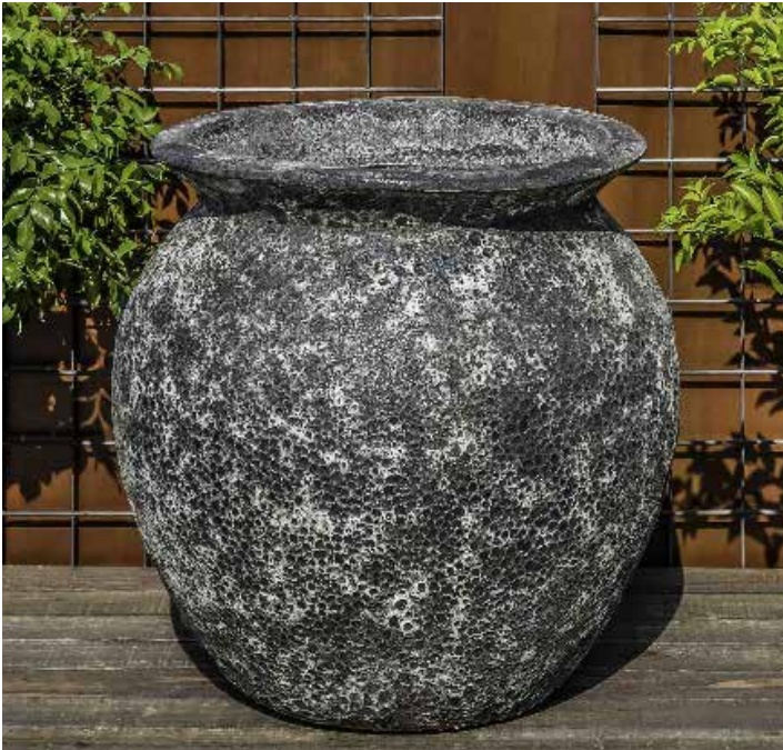
Shown in Fossil Grey