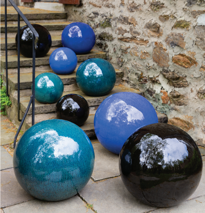
Shown in Riviera Blue, Cola and Indigo Rain