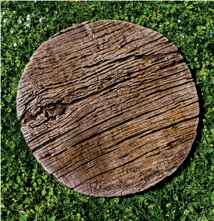
Shown in Brownstone