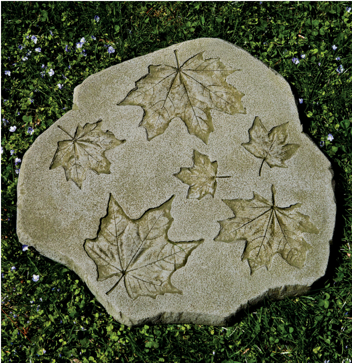
Shown in English Moss