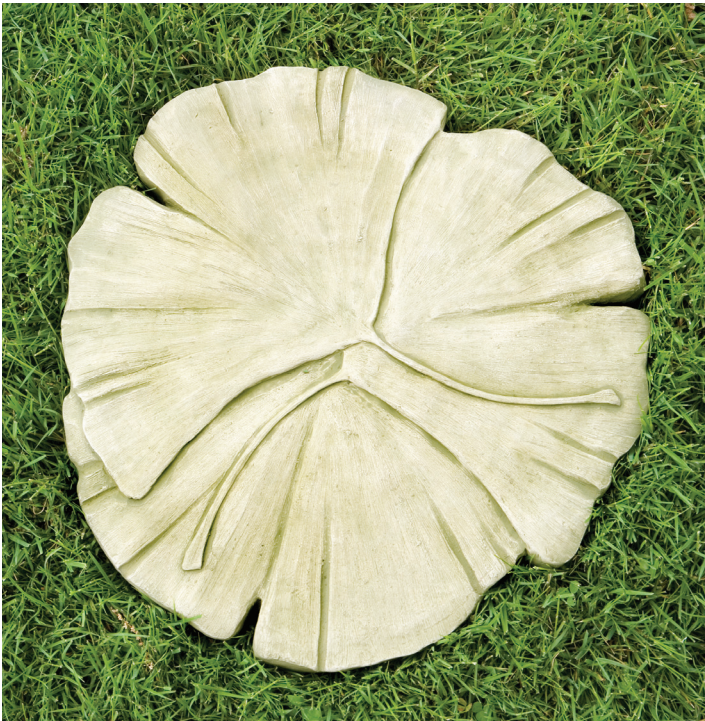
Shown in English Moss