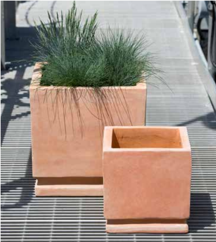
Shown in Terra Cotta