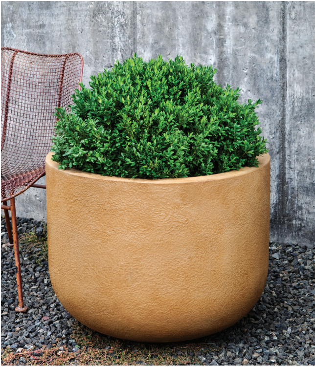
Shown in Travertine