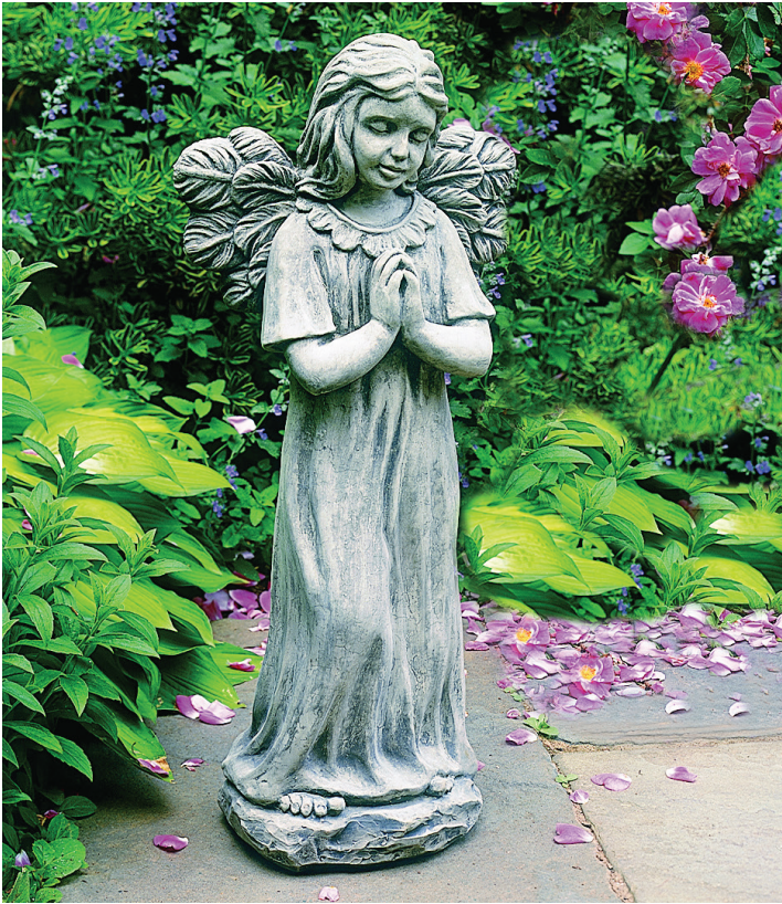
Shown in Alpine Stone