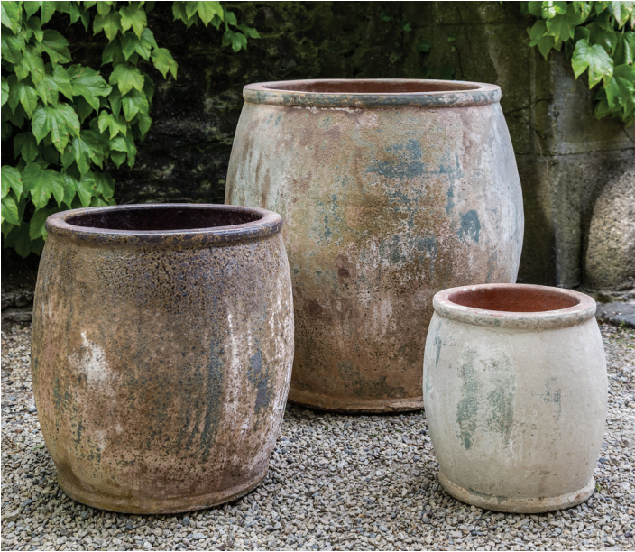
Shown in Vicolo Terra

Please note that actual colors may vary slightly from those depicted here.