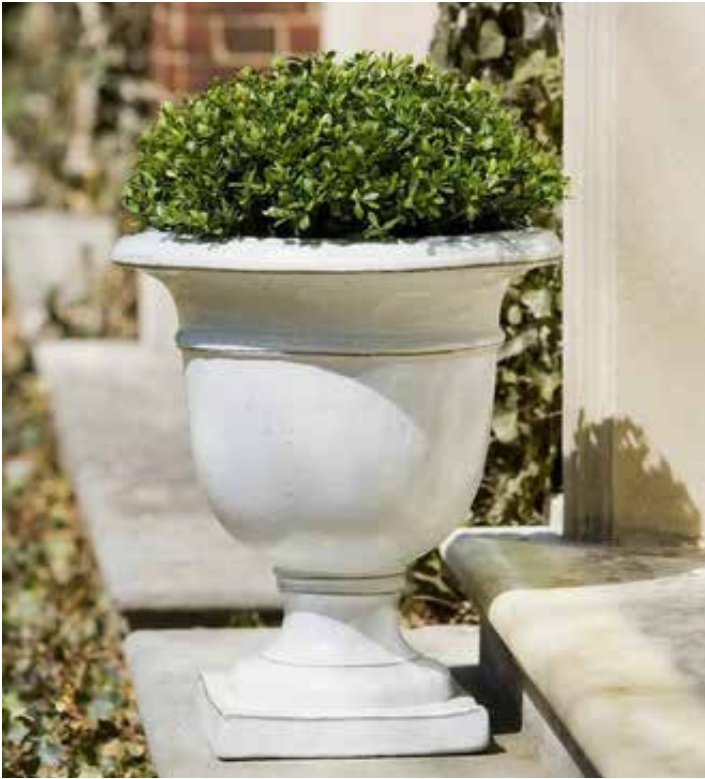
Shown in Antique White