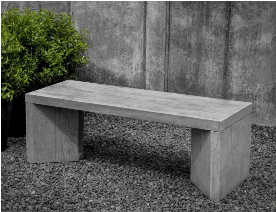
CHENES BRUT BENCH