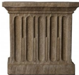
Aged Limestone (AL)