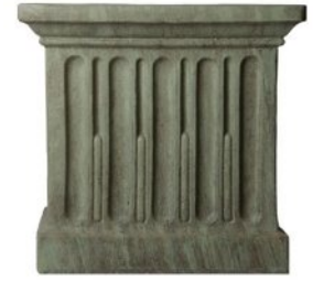
Copper Bronze (CB)