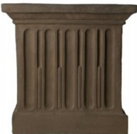
Pietra Vecchia (PV)*