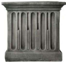
Alpine Stone (AS)

Due to the hand-application process and photography, actual colors may vary slightly from those depicted in these examples. Please consult our catalog photos and our website for examples of variations of our patinas.