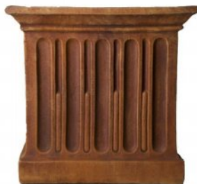
Ferro Rustico (FR)*