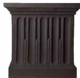
Terra Nera (TN)*