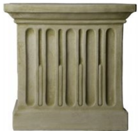
English Moss (EM)