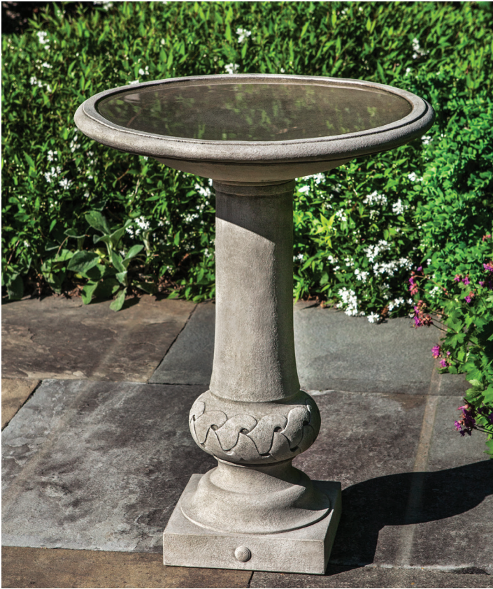
Shown in Greystone