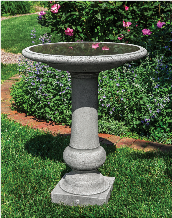
Shown in Alpine Stone