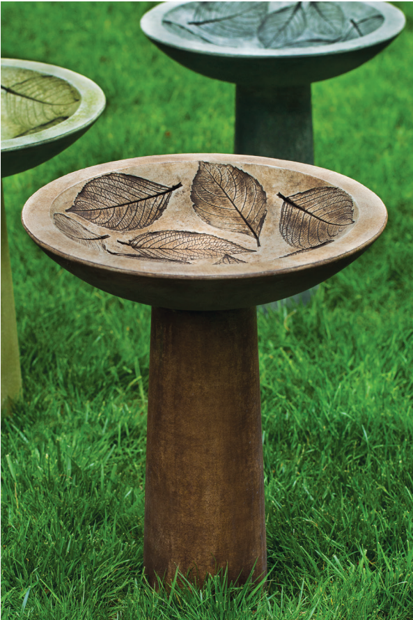
Shown in Brownstone