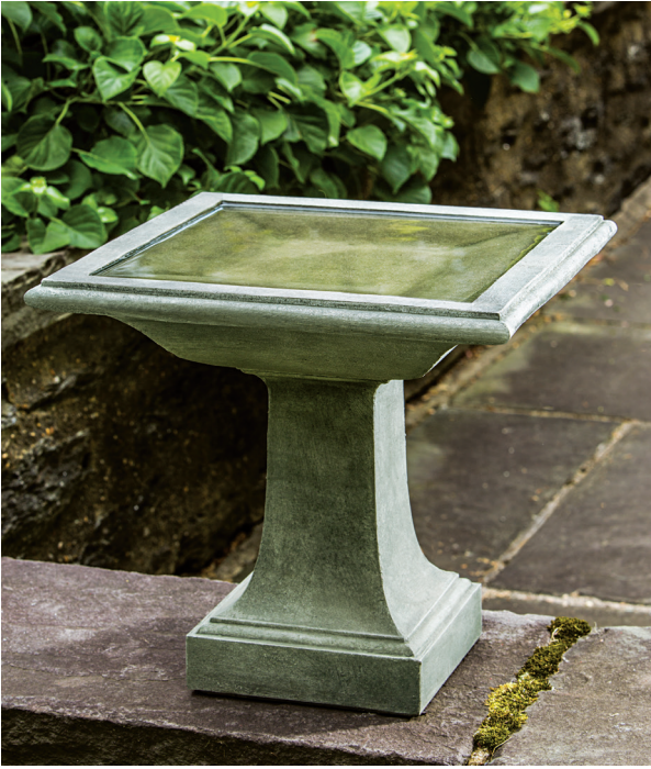
Shown in Verde