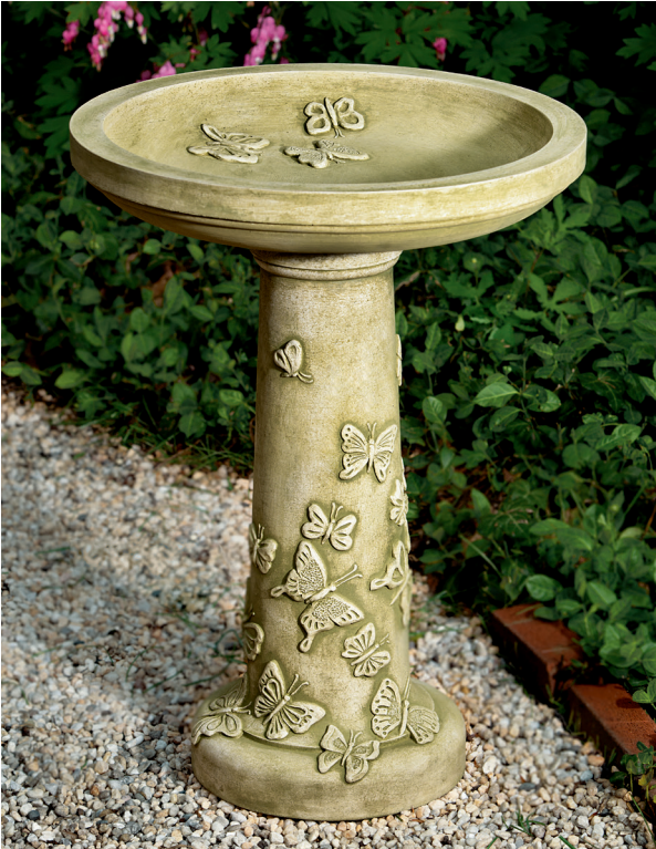
Shown in English Moss