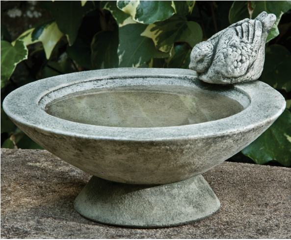
Shown in Alpine Stone