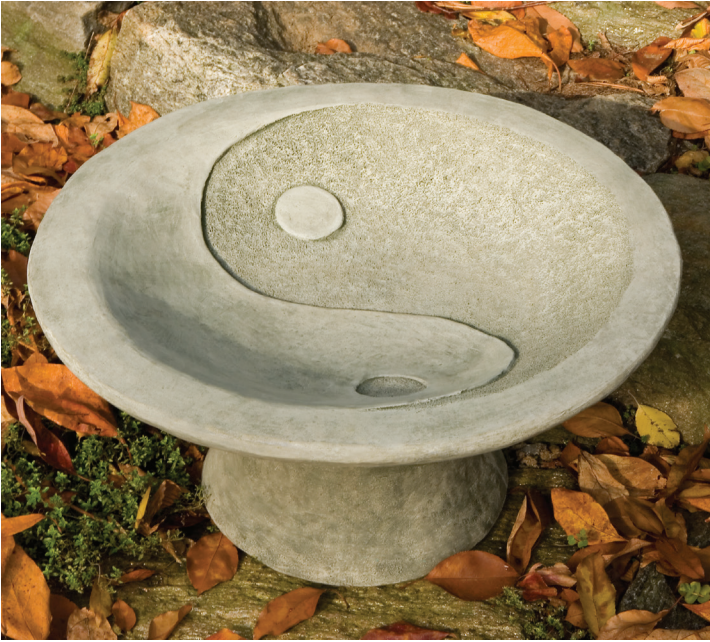
Shown in Verde