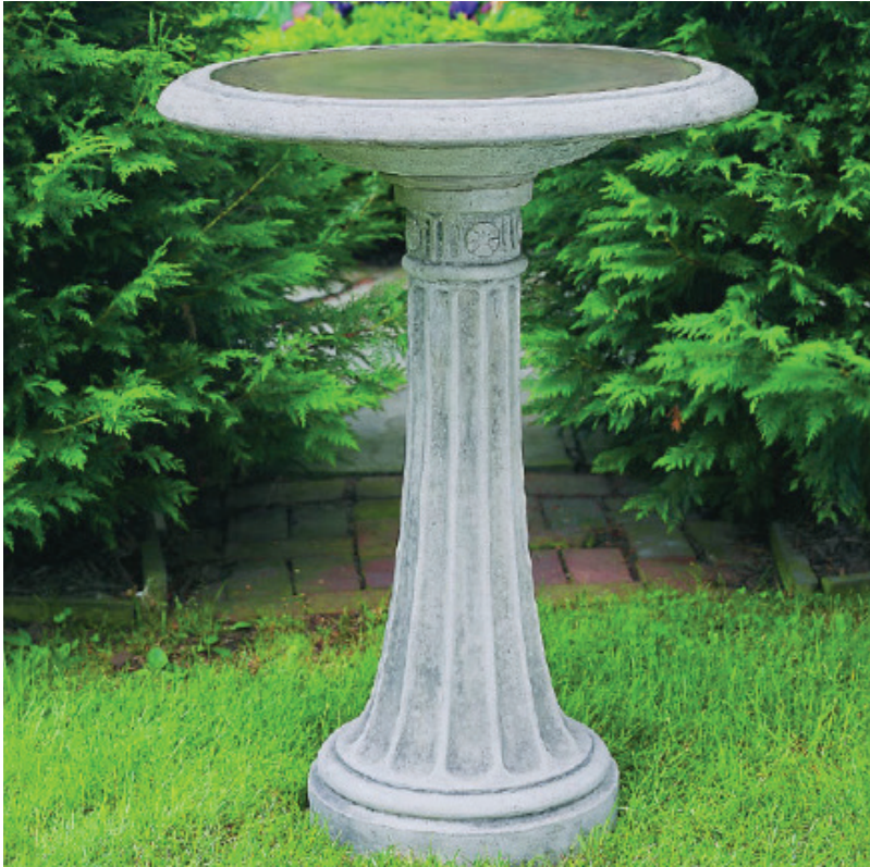
Shown in Greystone