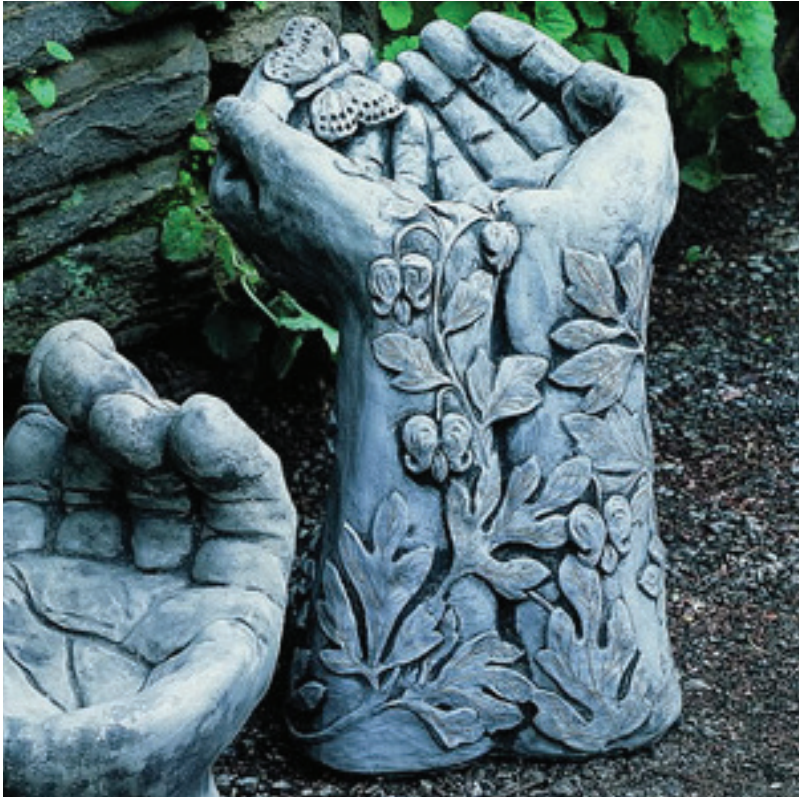
Shown in Alpine Stone