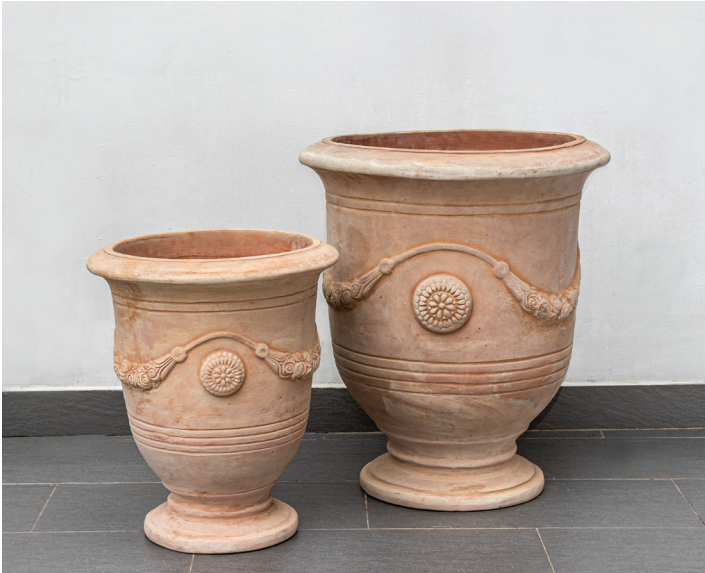
Shown in Terra Cotta

Please note that actual colors may vary slightly from those depicted here.