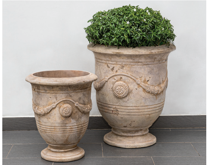
Shown in Antico Terra Cotta