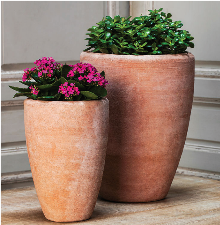
Shown in Terra Cotta