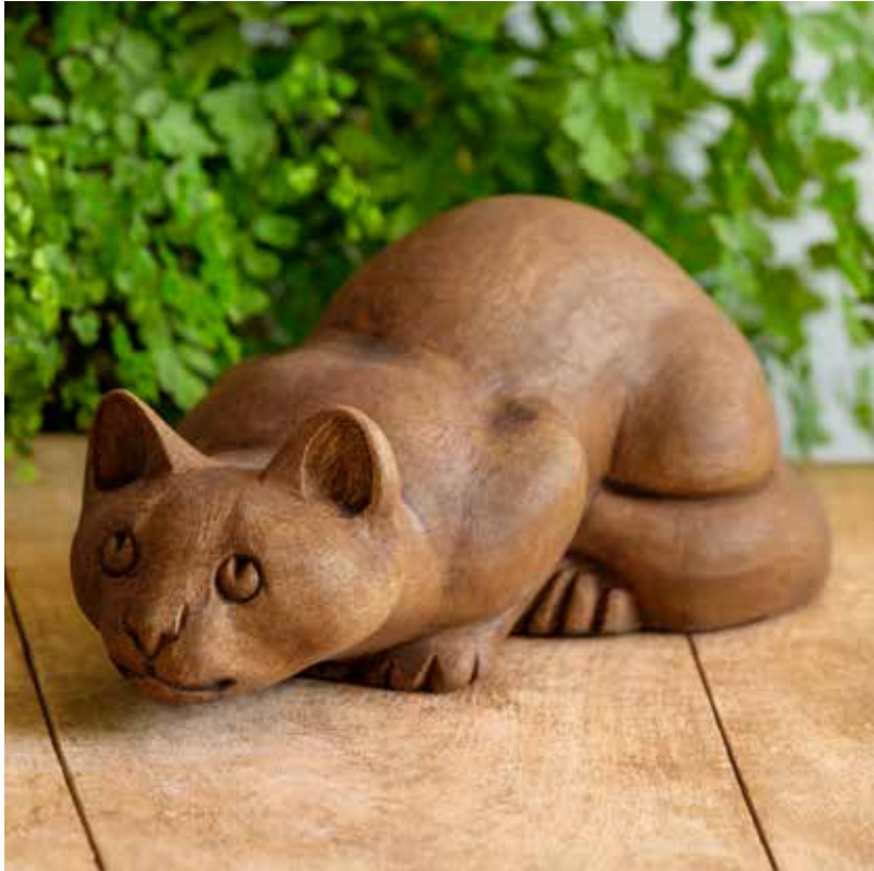
Shown in Pietra Nuova