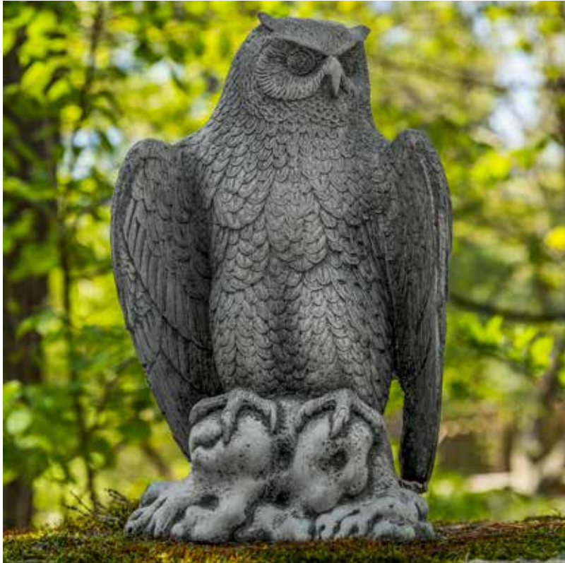
Shown in Alpine Stone