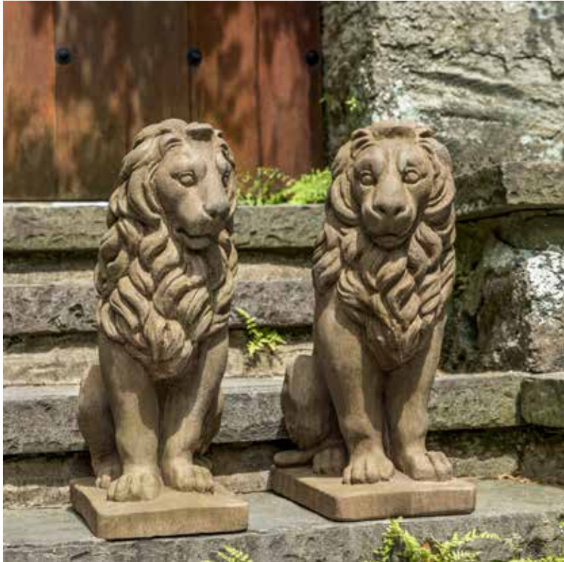
Shown in Aged Limestone