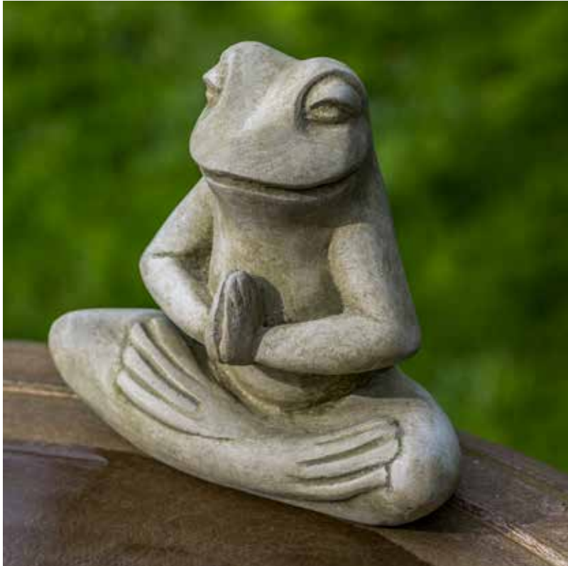
Shown in English Moss