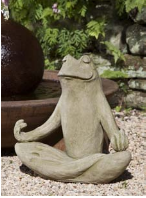
Shown in (EM)