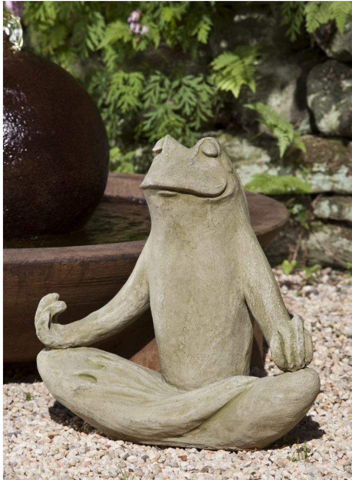
TOTALLY ZEN FROG